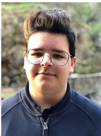
Figure 1: A picture of the author taken in Alum Rock Park in San Jose, CA.

This will give you the graphic seen below in Figure 1.